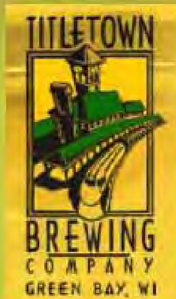
Titletown Brewing Company