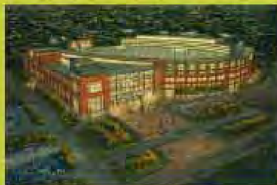
Lambeau Field Home of the Green Bay Packers