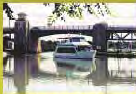
Foxy Lady Cruises On the Fox River