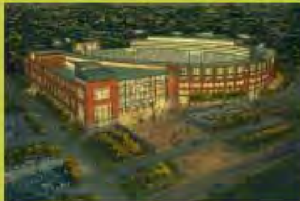
Lambeau Field Home of the Green Bay Packers