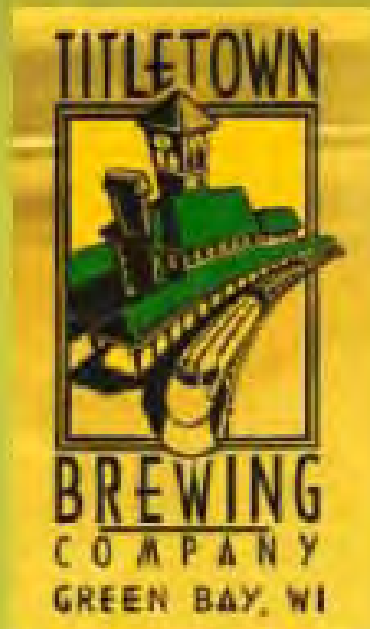
Tiltown Brewing Company